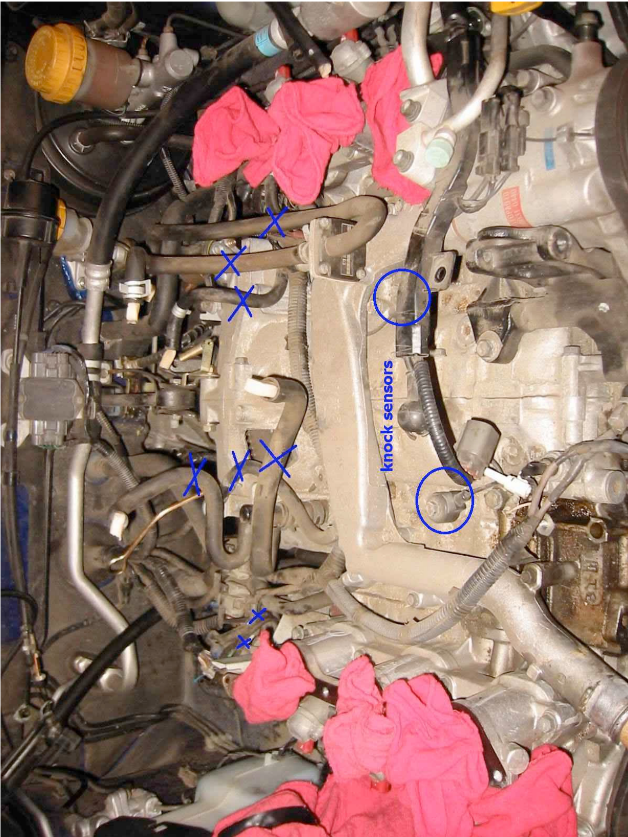
Top of engine