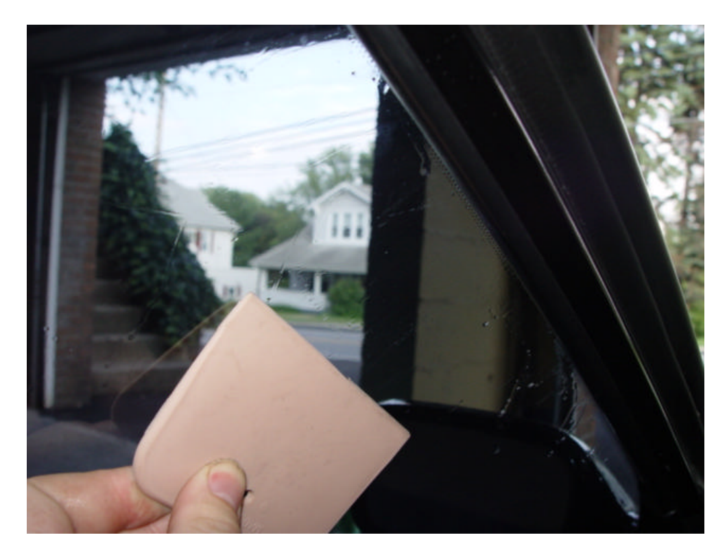
Your window is now tinted! Repeat the process for the rest of the windows.

Smooth all of the tint solution out from under the film with a bondo knife.