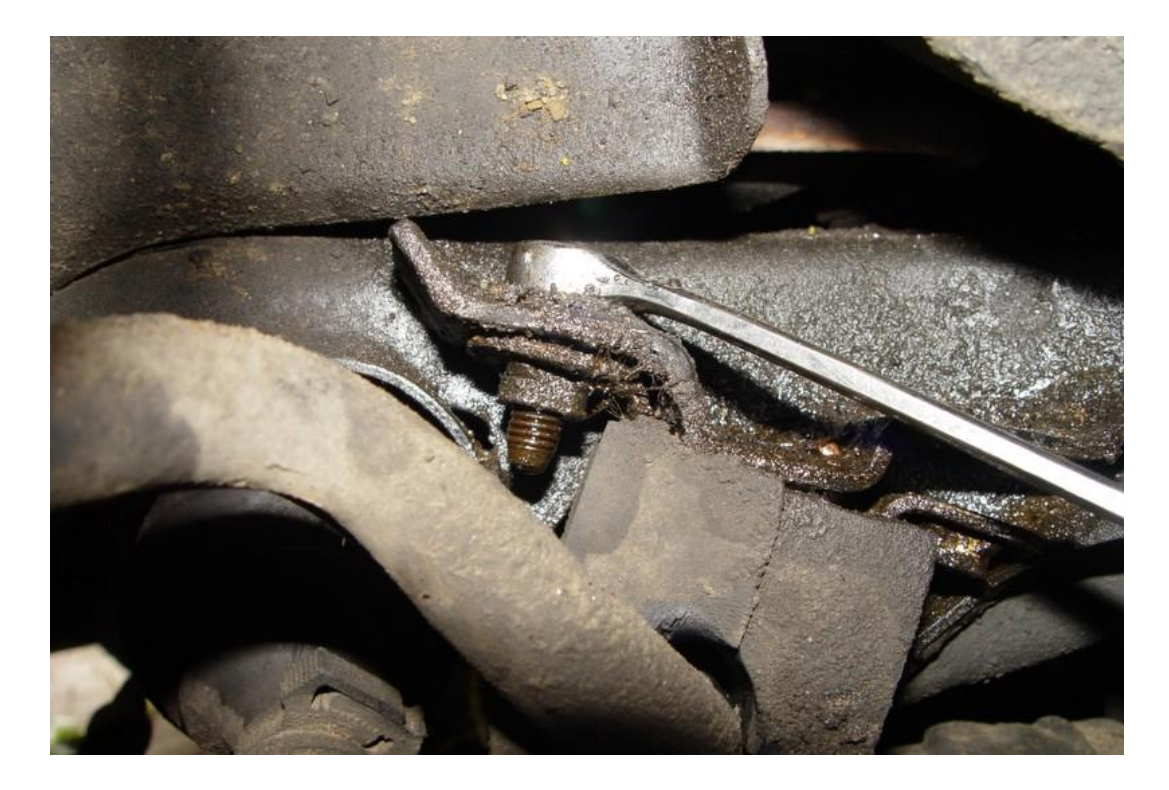
Once the bolts are removed you'll need to pry the retainer bracket straight down with a screw driver or other small tool.