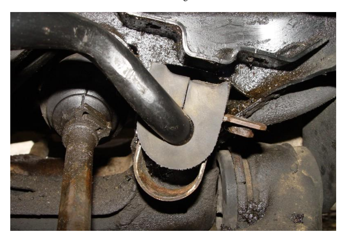
Now, with the bracket fully in place, line up the mounting holes with the flange on the subframe.

Now slide the retainer bracket over the bushing.