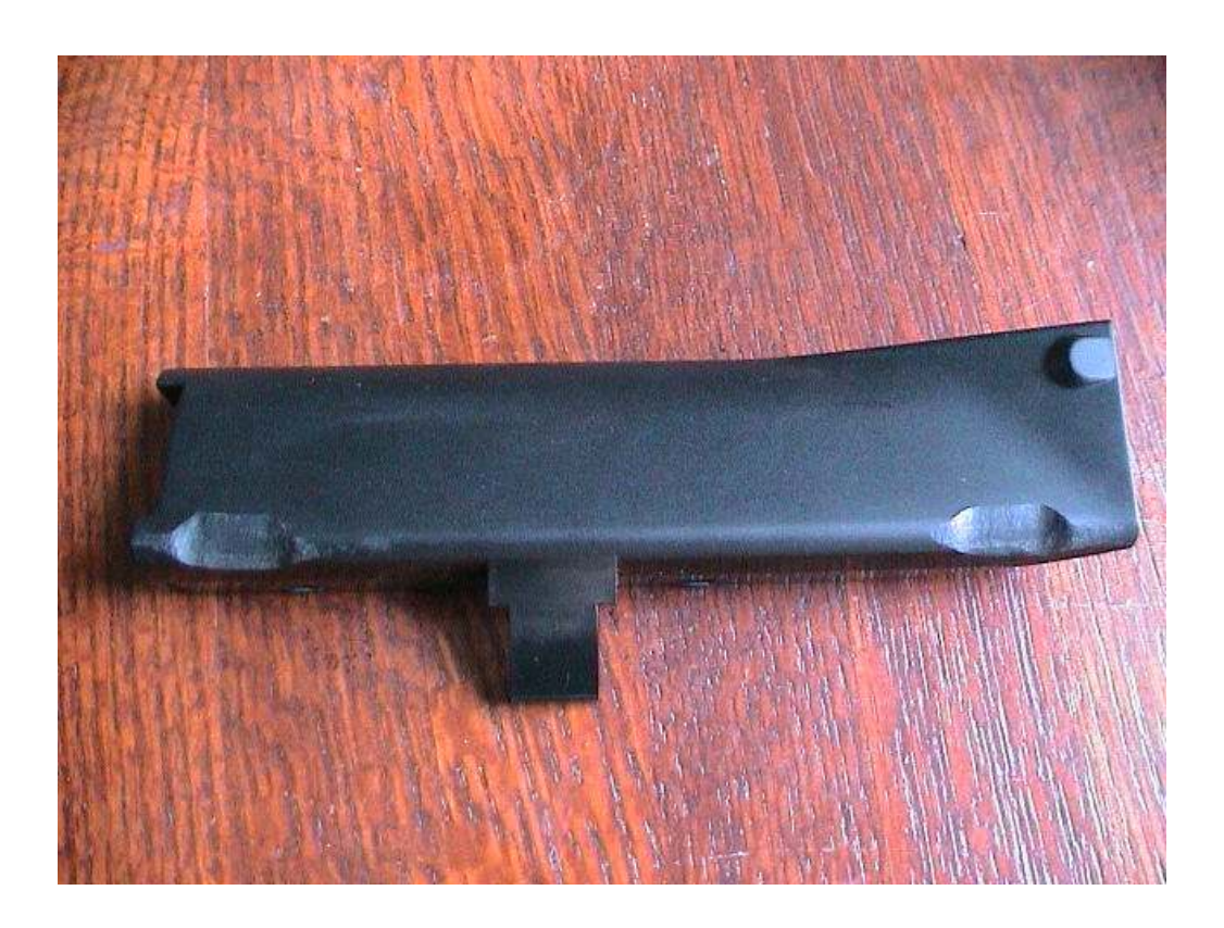
Here is a picture of the area that needs to be ground off some so the knobs will not rub.