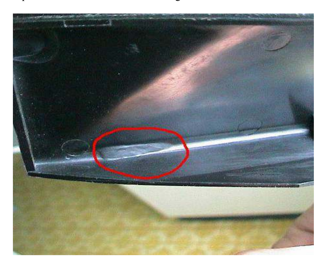
When grinding, be careful not to grind all the way through the cover. You will start to notice where it is getting thin or starting to blister on the back side when you are almost through the cover. (see red circle)